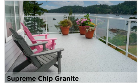
Supreme Chip Granite